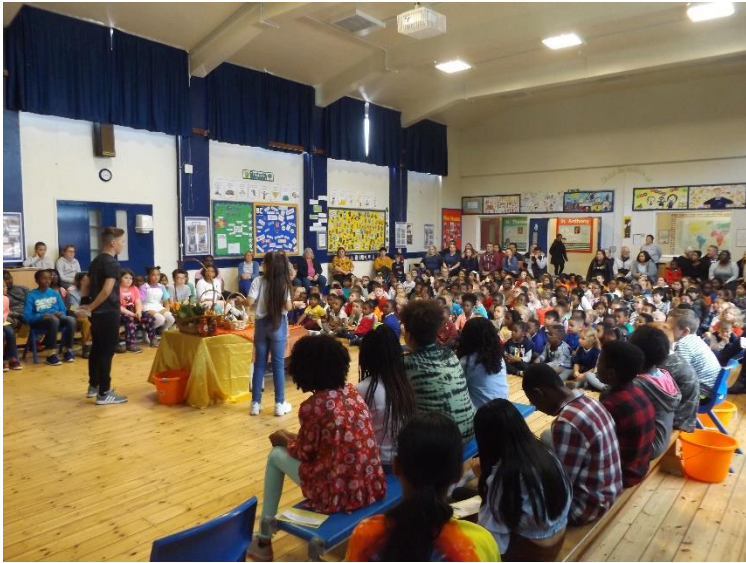
Y6 delivering their CAFOD /Harvest assembly.