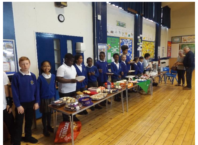
Macmillan Coffee Morning - a great morning was had by all. Y6 did a great job serving and helping to wash-up!