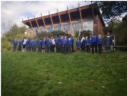
Y3 pictured on their recent trip to Meanwood Valley Farm – they are studying rocks and soils